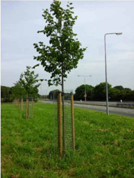
Plate 5. Planting in the soft highway verge

The widest verges will be suitable for planting at a higher density with small nursery stock whilst narrowest verges could be strategically planted with large specimens.