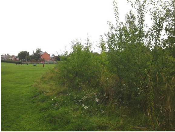
Plate 3. Whip tree planting undertaken at The Willows, Hope categorised as Formal Open Space

To assist with creating a diverse and resilient tree cover less common tree species will be used. These less common species will also provide added interest and will not look out of place in a more formal landscape. Within Formal Open Space there is an over reliance on mature and late mature trees to provide canopy cover and new planting will result in a more varied age structure.