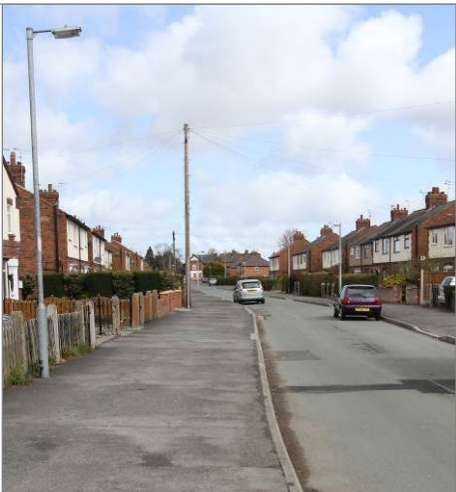
Plate 10. Park Avenue, Saltney