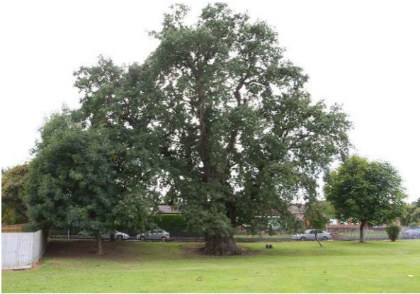
Plate 13. Ancient oak at Ysgol Bryn Gwalia, Mold

Ysgol Bryn Gwalia in Mold has an ancient pedunculate oak growing in the grounds with a trunk girth of 8.30m, the largest known in Flintshire. The oak is the school’s emblem and the most accurate estimate of the tree’s age using White 53 is 774 years. Despite the oak’s great antiquity the tree is remarkably uniform and vigorous and because of this lacks veteran features.