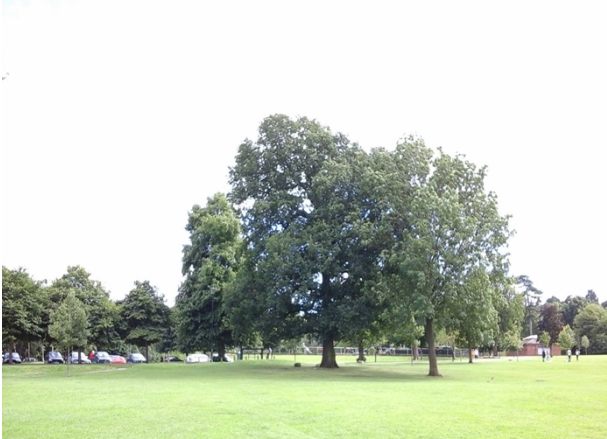
Plate 2. Mature trees and parkland at Wepre categorised as Formal Open Space

To increase biodiversity there is also the opportunity to sow wildflowers adjacent to trees where reduced grass cutting occurs as part of revised open space management.