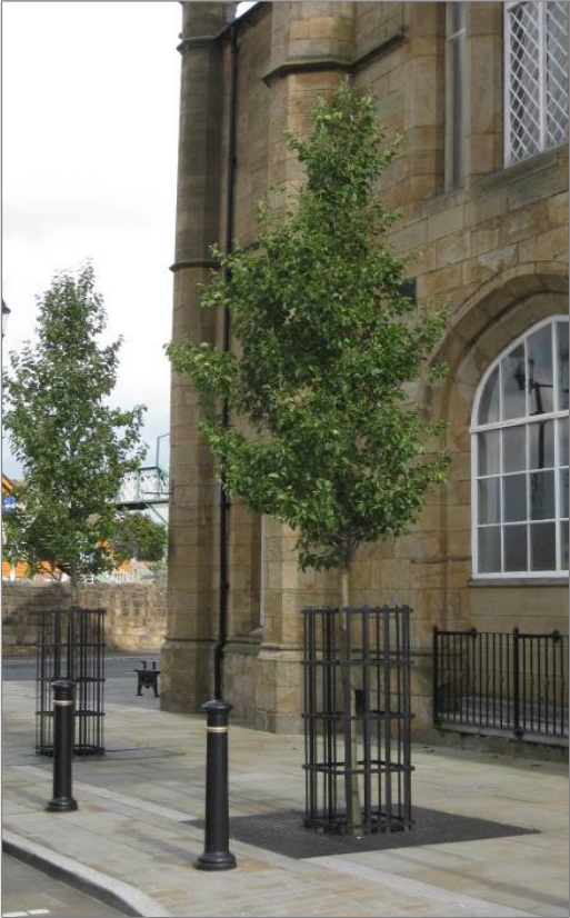
Plate 15. Treeneration funded tree planting in Flint

The plan seeks to be a key document in securing funding from the Welsh Government under the Sustainable Development Fund and other Welsh Government grants that are expected to become available in the future. Occasionally grant funding for tree planting becomes available at short notice and the plan will be able to identify suitable sites that can be planted ‘off the shelf’ at short notice.