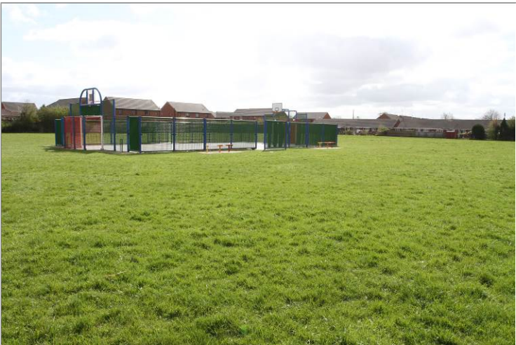
Plate 9. Park Avenue playing field, Saltney

As well as requiring maintenance tree planting schemes will require long term grounds maintenance regimes to be revised. Areas of mown grass can be cut with tractor driven machinery to within 5m of trees with a longer grass sward left underneath trees cut once or twice a year if desired. Where it is necessary to maintain regular mowing adjacent to a tree small ride-on cutting machinery can be used. Under no circumstances should grass trimmers be used at the base of trunks because this inevitably causes damage.