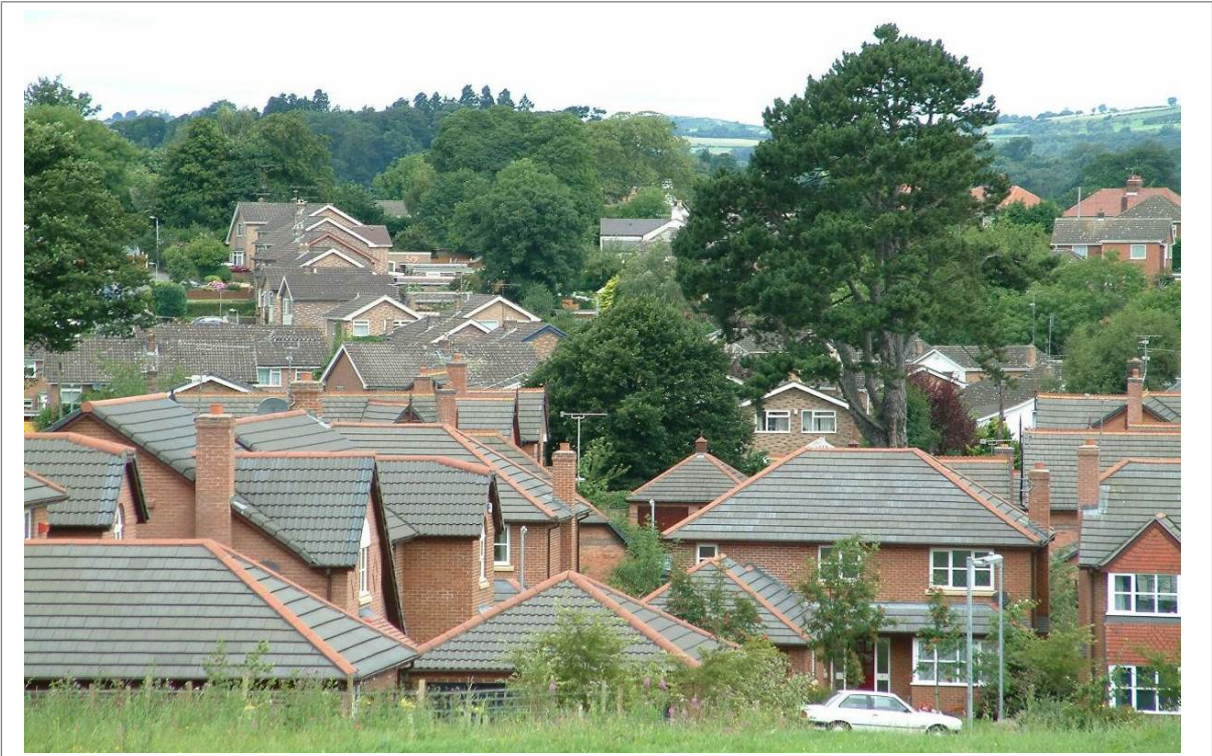
Plate 11. Mold urban canopy cover

The traditional approach tree management looked at a tree in isolation and what was required to solve that particular problem or issue. The traditional method was not strategic and tree canopy cover was not measured, so it was unclear whether or not it was sustainable. The advent of the urban forestry movement recognised that the whole urban forest resource is much greater than the sum of its individual parts and is a shared resource with a monetary value. To sustainably manage urban canopy cover the council will need to adopt the modern approach (Table 9).