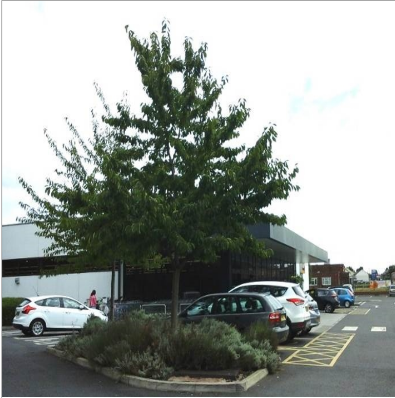
Plate 11. Landscaping in a new retail development, Flint

Policy L1 of the Flintshire Unitary Development Plan is the policy that supports landscaping and states that;