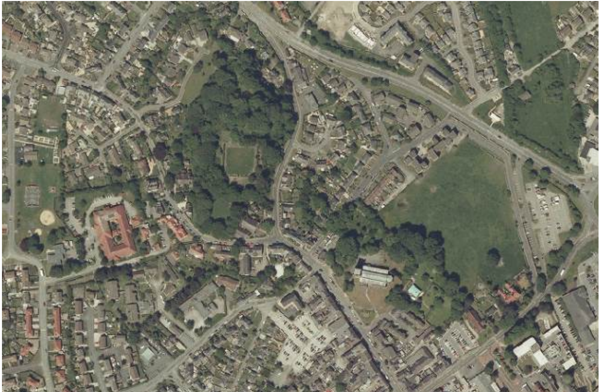
Plate 1. Mold aerial photograph from 2009

A 2016 study 12 published by CNC/NRW looked at urban canopy cover across Wales' towns and cities. Urban canopy cover is classed as the amount and distribution of urban land under tree or woodland cover when assessed using aerial photographs. The study was the first ever country-wide survey of its type in the world and found that the average canopy cover for Wales was 16.3% in 2013 and down from 17.0% in a previous 2009 survey.