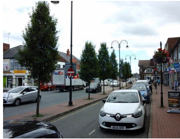
Plate 7 and 8. Flint street tree planting undertaken in 2013 (Before, left and after, right)