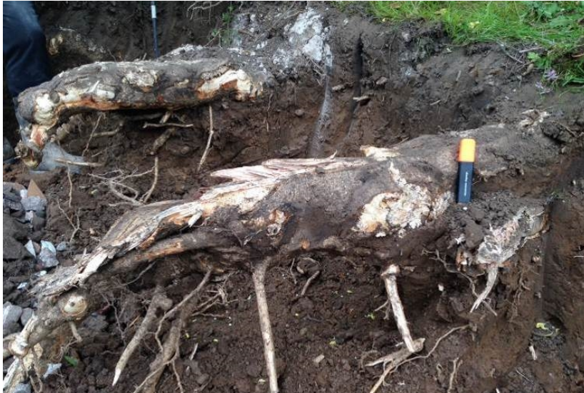
Plate 13. Structural roots severed just below the surface during excavations

Flintshire is a county where the overlying geology comprises of glacial clay, sands and gravels with occasional alluvial sand and gravel deposits in valleys. Due to this geology the consequent overlying soil type is not prone to shrinking when drying out and the potential for tree root related subsidence to occur is low. Notwithstanding, if subsidence is suspected to have been caused by the roots of a council tree any claim made to the council should be supported by technical information (An arboricultural report, structural engineer's report and a period of crack monitoring). Where a tree is proven to have been the main factor causing subsidence remedial action will be undertaken appropriate to all the relevant factors, including amenity and arboricultural best practice.