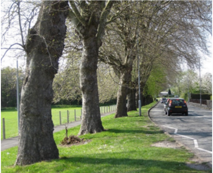
Plate 6. Mature highway trees in Flint

Planting within the pavement on streets is technically challenging and requires consultation with a wide range of stakeholders (e.g. highways engineers, utility providers, landscape and tree professionals). Planting must meet highways standards whilst creating suitable conditions for tree growth. Nevertheless, street tree planting can be extremely effective at improving the quality of the public realm. Due to the relatively high cost, planting in paved areas will usually be undertaken as part of externally funded regeneration schemes.