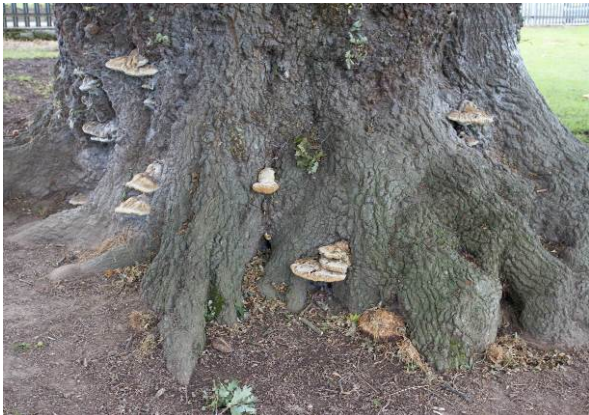
Plate 14. Base of ancient oak at Ysgol Bryn Gwalia