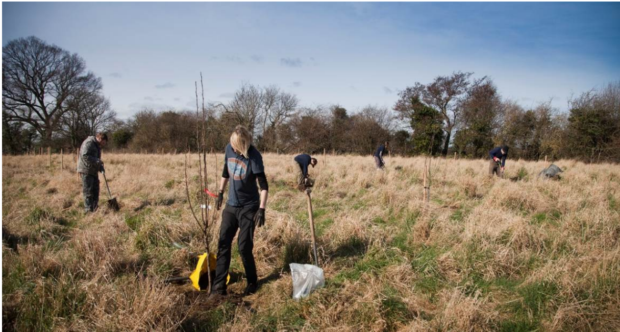
Plate 14. Volunteers planting orchard trees at Llwyni on the edge of Connah's Quay

Partners for the delivery of the plan will include town and community councils, with other partners potentially including Coed Cadw/Woodland Trust. The Countryside Service has already established good working partnerships and manages woodland at Caergwrlle Castle on behalf of the community council.