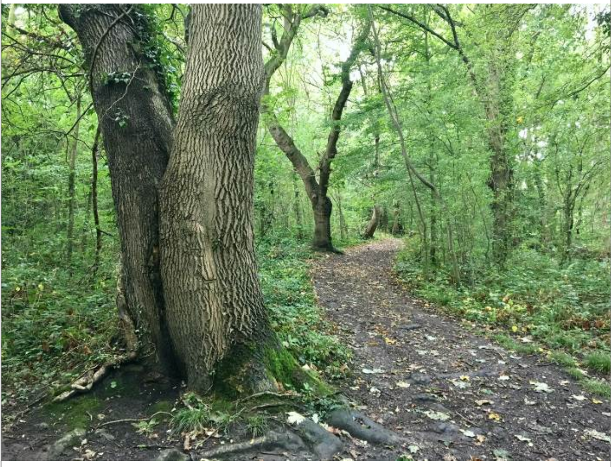
Plate 12. Urban woodland at Wepre Park

The council will protect and enhance its own urban woodlands guided by long term woodland management plans. Management plans will be based upon a policy of continuous cover so that long term canopy cover remains stable or is increased. Felling will only be carried out for overriding safety reasons, to facilitate natural regeneration or carry out new planting. Where felling is considered acceptable it will only be carried out in small woodland compartments or as a thinning operation. In exceptional cases young scrub woodland may be cleared to enhance particularly rare plant communities (e.g. limestone grassland), geological features (e.g. limestone pavement) or ancient monuments.