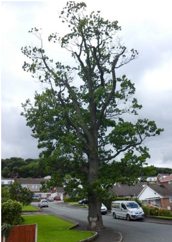
Plate 12. A mature oak in decline subject to frequent inspections

The risk of being killed or injured by a falling tree is frequently exaggerated. This is believed to be due to over reporting of incidents by the media, probably because they are considered to be a freak occurrence and newsworthy 37 . Statistically, the risk of being killed by a falling tree or branch situated in an area of high public use is extremely low 38 .